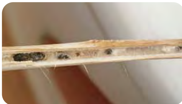
Figure 4. Sclerotia forming inside an infected canola stem

20% plants collected are infected with sclerotinia