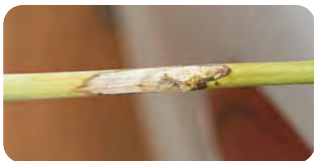
Figure 2. A typical sclerotinia stem rot stem lesion